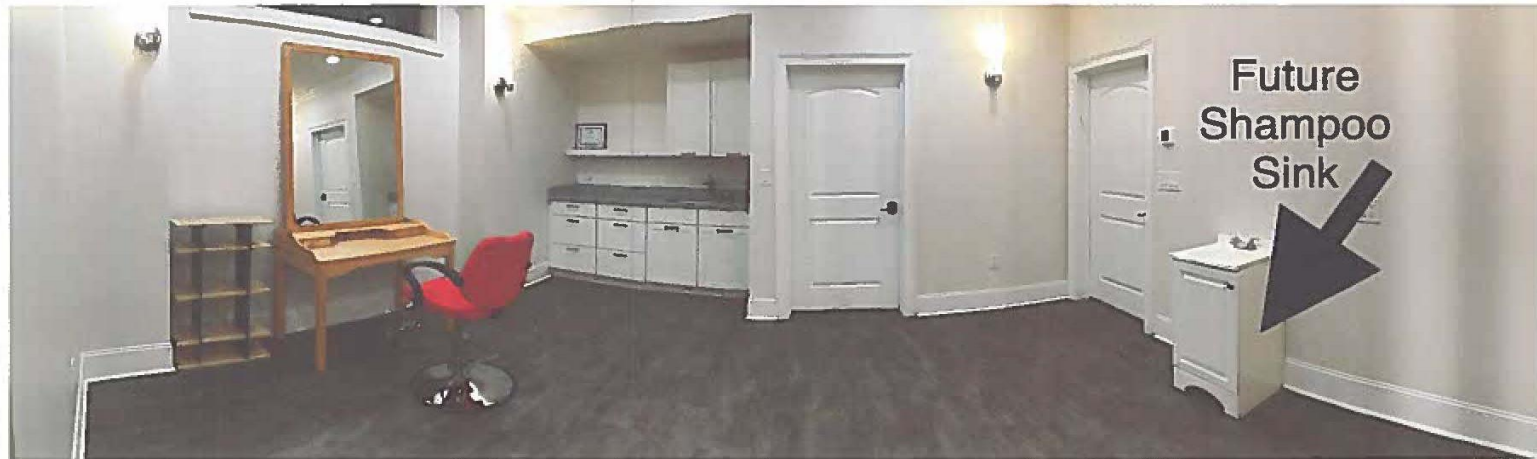
(Distorted image due to panoramic view)