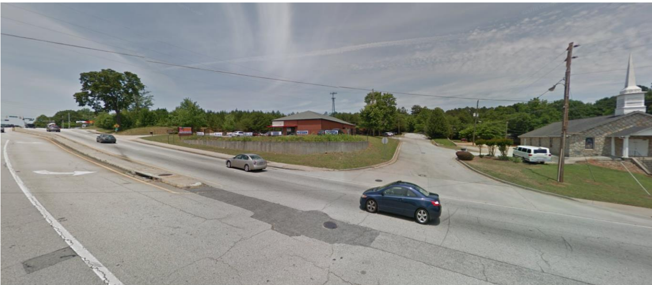
Access from Rockbridge Road.