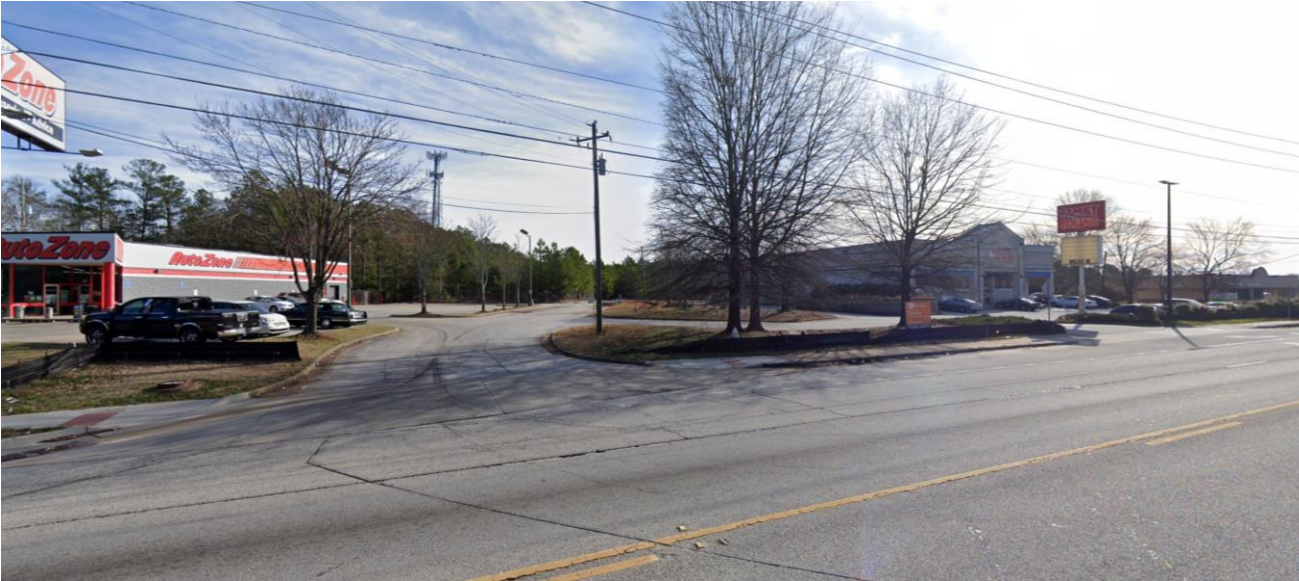
Access from North Stone Mt. Lithonia Road.