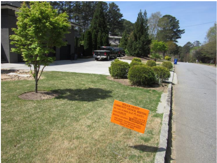
View from Citadel Drive Street Frontage