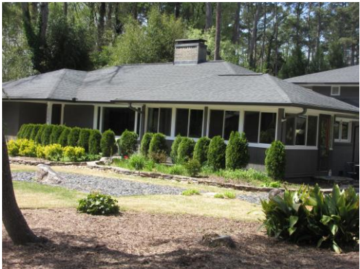
View from Brook Forest Drive Street Frontage