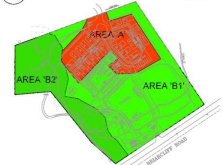
1 ZP PROJECT OPEN SPACE EXHIBIT SCALE: 1"=150'