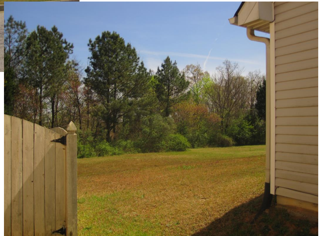
(right) Rear yard of subject property.