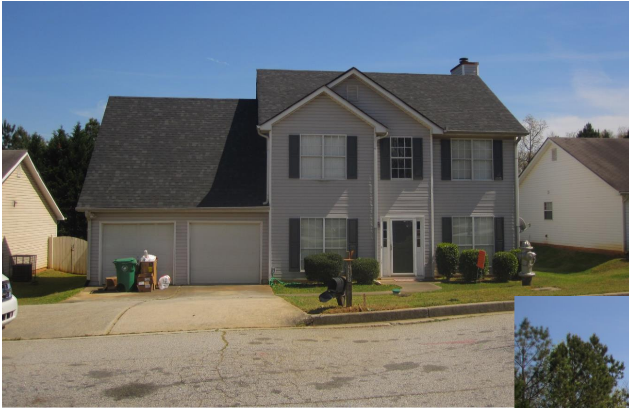
(left) Subject property.