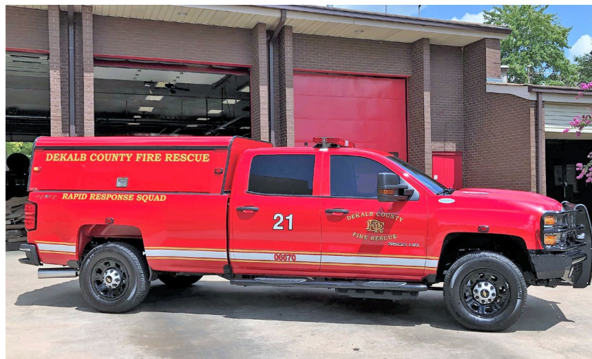
DeKalb County added a rapid response vehicle at Station 21 which serves Dunwoody and surrounding areas.

DECATUR, Ga. – The DeKalb County Fire Rescue Department (DCFR) has added two new rapid response vehicles, expanding the total number of units to five. The additional vehicles are in service at Station 20 (Panthersville) and Station 21 (Dunwoody) and respond to emergency medical and fire suppression calls.